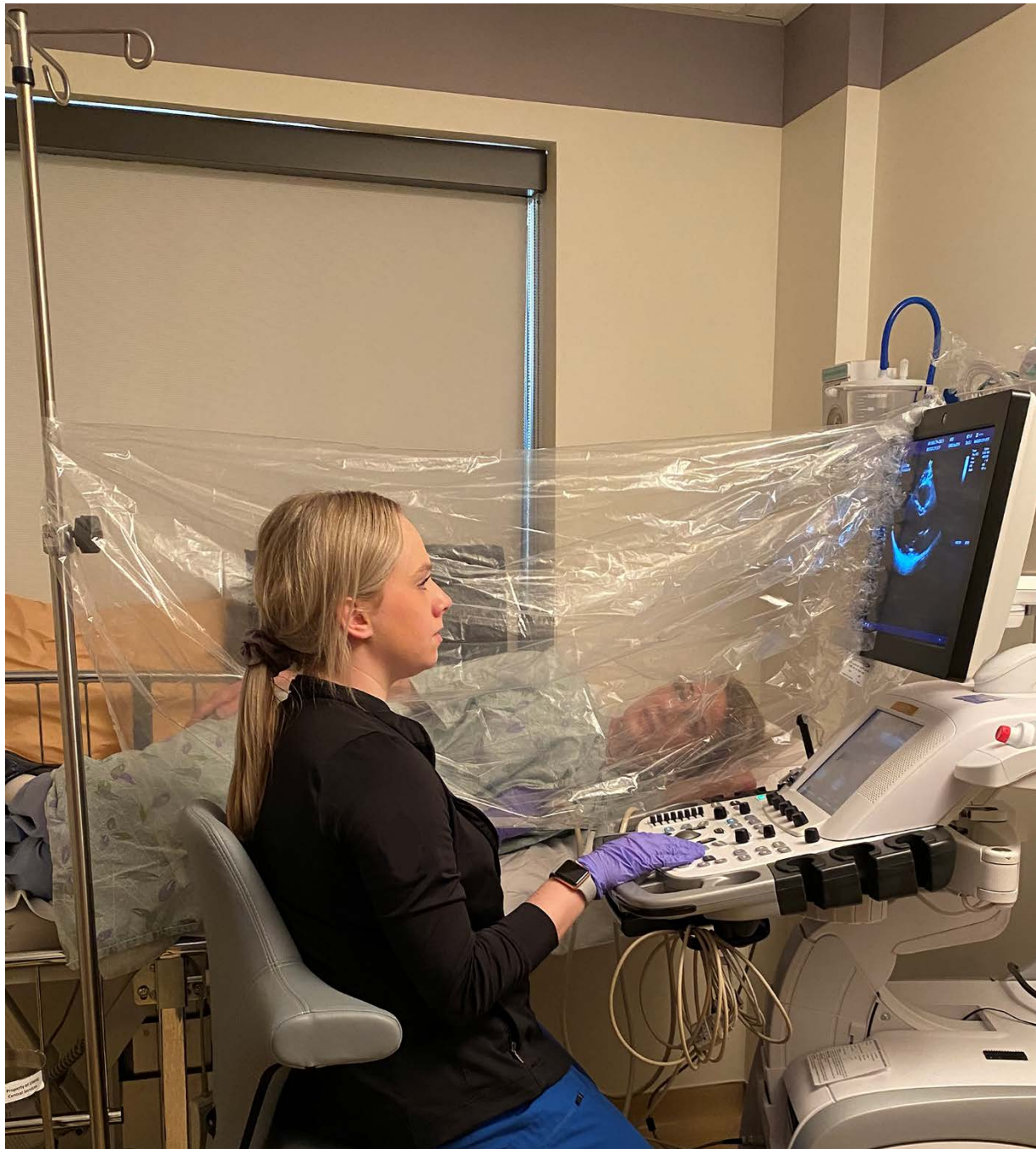
Figure 2. Barrier example used between the patient and the sonographer. 15-17 This is a posed photograph demonstrating the barrier technique and how the sonographer arm can maneuver under the barrier shield. If this were a real situation the sonographer would be wearing appropriate personal protective equipment.