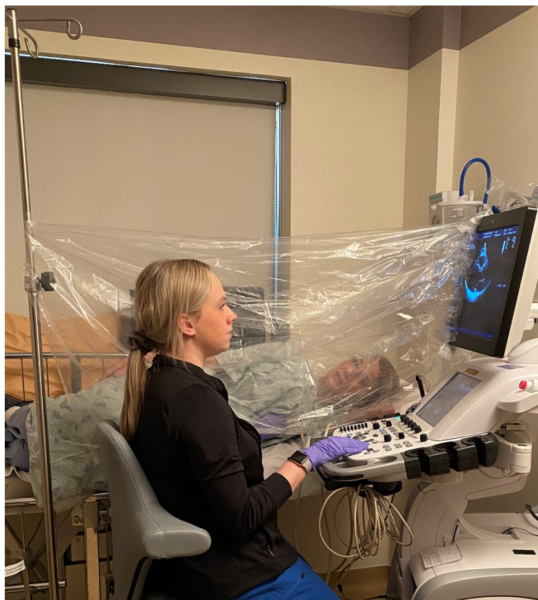
Figure 2. Barrier example used between the patient and the sonographer. 15-17 This is a posed photograph demonstrating the barrier technique and how the sonographer arm can maneuver under the barrier shield. If this were a real situation the sonographer would be wearing appropriate personal protective equipment.

Prior to entry into a room to scan a suspected and/or confirmed COVID-19 patient, all ancillary equipment (extra transducer, EKG leads, linens, etc.) should be removed from the ultrasound system to limit exposure of additional equipment. Sonographers should explore if the patient is already hooked up to an ECG system that could be imported into the echocardiography machine, versus taking the ultrasound system cable and ECG leads. This reduces the need for cleaning ECG cables and leads, which may be difficult to disinfect. If available, the use of a barrier between the bed (where the patient is lying) and sonographer could be set up prior to imaging (see Figure 2). 15-17