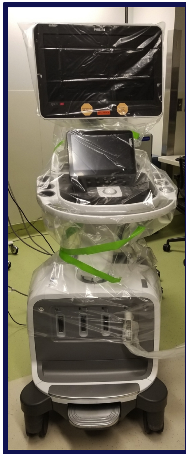
Figure 2 An ultrasound system with transesophageal echocardiographic capabilities is shown with a plastic cover. The screen, touchable parts, and transducer ports are covered by the disposable plastic cover.

A practical approach is suggested in Table 1. Following a transesophageal echocardiographic examination, all exposed equipment should be wiped down with a hospital-approved and vendor-recommended disinfection product in the procedure or intensive care room and in the induction room or anteroom. The transesophageal probes should also be thoroughly wiped (including handle, cable, and connector), placed in closed containers, and transported in those