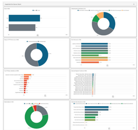
National Aggregate View

ImageGuideEcho also contains the capability to connect to registries already within the ARMUS platform at the individual patient level. Tracking the patient throughout the continuum of care creates unique opportunities to understand and leverage the value of cardiovascular imaging for the benefit of patient care . Furthermore, connections to outcomes data with other registries and also with national sources of outcomes information have clear impacts for increasing opportunities for echocardiography research by allowing for direct connections between quality imaging studies and improved patient outcomes.