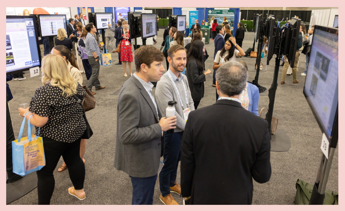
Scientific Sessions Abstracts

and showcasing cases and data-driven improvements in hospital care metrics. A panel of experts also provided valuable practical insights into using each modality. After a thought-provoking debate, TEE emerged as the favored method, though the discussion highlighted the benefits of multimodality imaging, including computed tomography (CT).